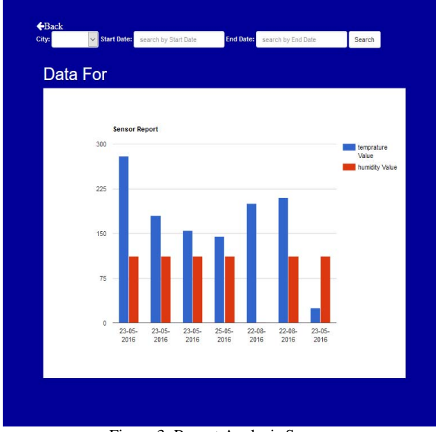
Figure 3: Report Analysis Screen

We performed a case study to evaluate the feasibility of the proposed mobile cloud framework as shown in Figure 3. Specifically, we used a Samsung Galaxy S4 and Samsung galaxy note 3 with Android OS 4.4 to collect Temperature and humidity sensor data. We used Azure as the cloud computing platform. Azure enables software platforms to move from their traditional development environments into the cloud. Azure offers Platform-as-a-Service (PAAS), providing an ideal foundation to build robust and scalable Web applications. Abundant APIs are available to developers to make the mobile devices work seamlessly with Azure. Figure 3 shows the data flow in the sequence of data recording, storage, analysis, and results notification.