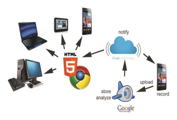
Figure 4: Data flow of Experimental setup

Communication statistic data is collected from Android system log before the upload operation. Data uploading happens automatically when the phone has a valid WIFI Internet connection. If the phone has not connected to WIFI network for a whole day, the data will then be saved on the phone until the time the WIFI connection is available.